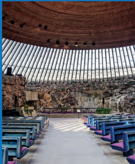
Interior of the Tempeliaukio Church, also known as the Church of the Rock or Rock Church.