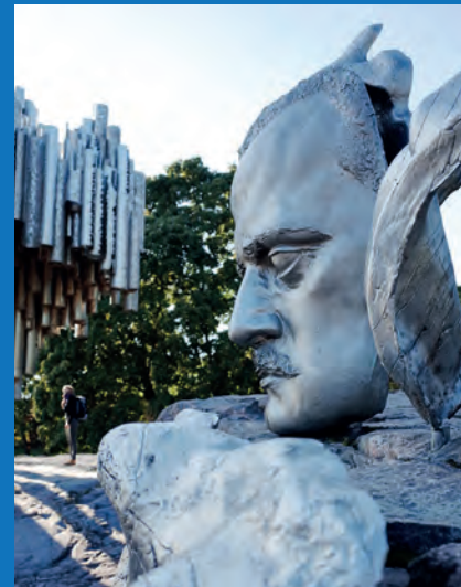
The Sibelius Monument, resembling organ pipes, is made of welded steel with over 600 pipes and with the bust of the composer on one side.